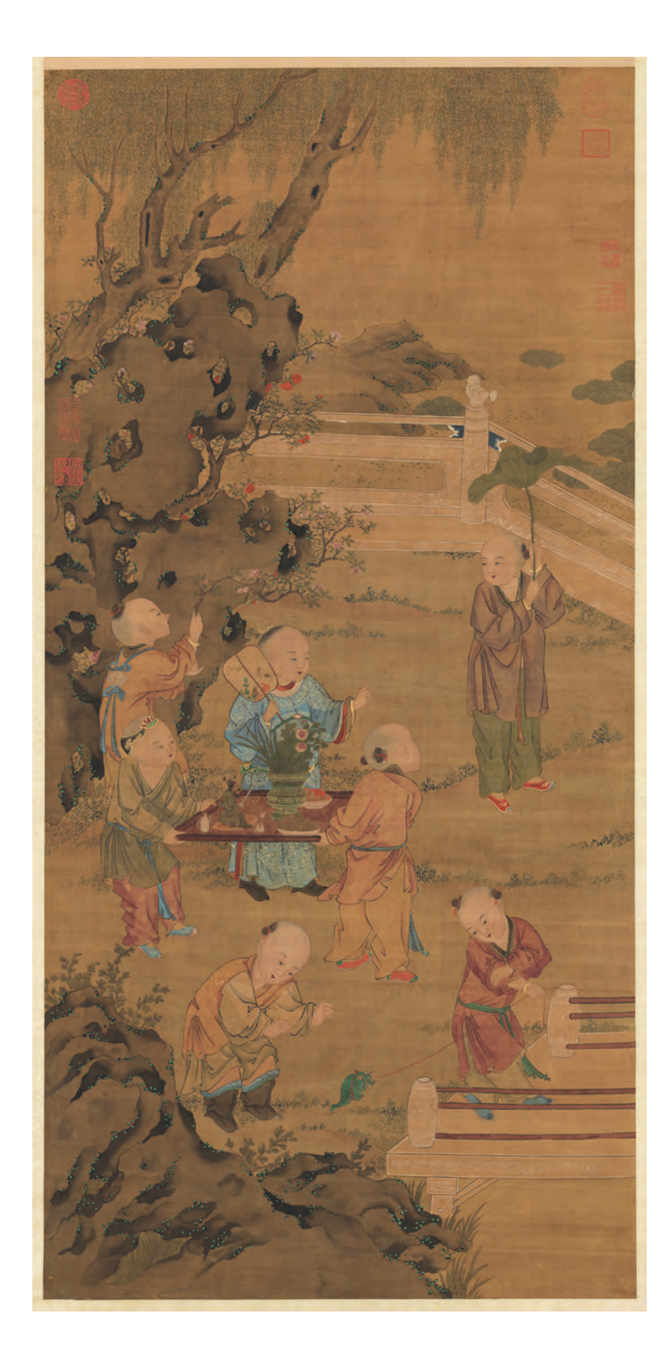
4. Anonymous, Children Playing in Summer (Xiajing xiying tu 夏景戲嬰圖). Ming copy based on the Yuan original.

Palace Museum, Taipei. https://theme.npm.edu.tw/ opendata/DigitImageSets