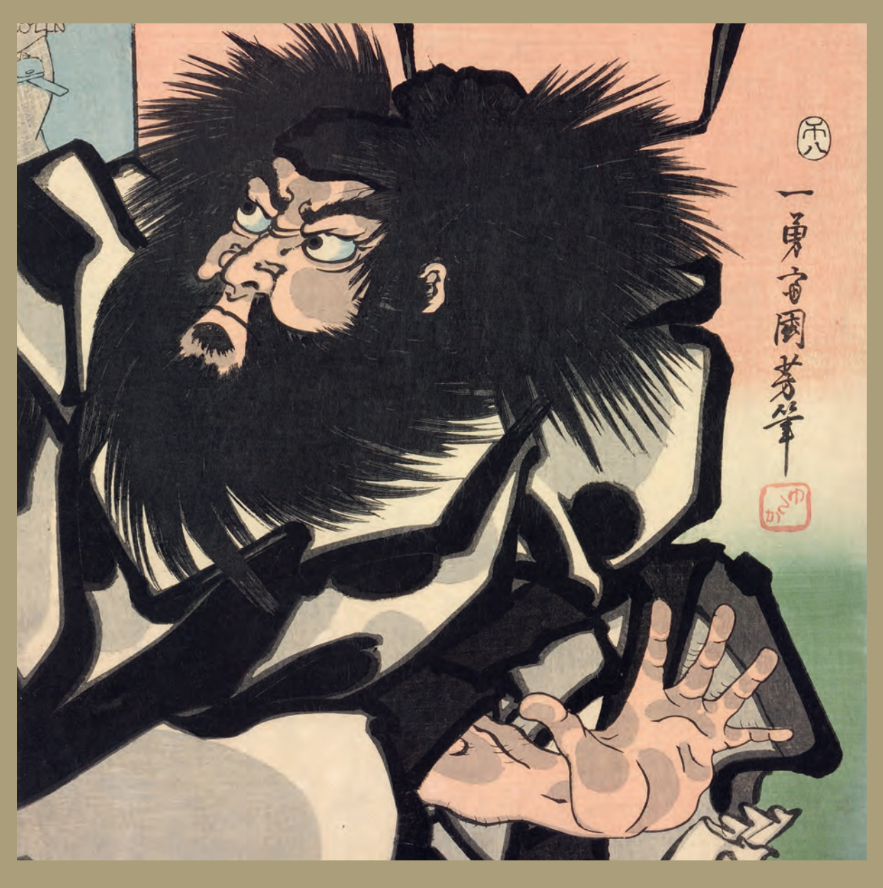
Detail of Utagawa Kuniyoshi, The Demon Queller Exorcizes Demons Quickly (see p. 14)